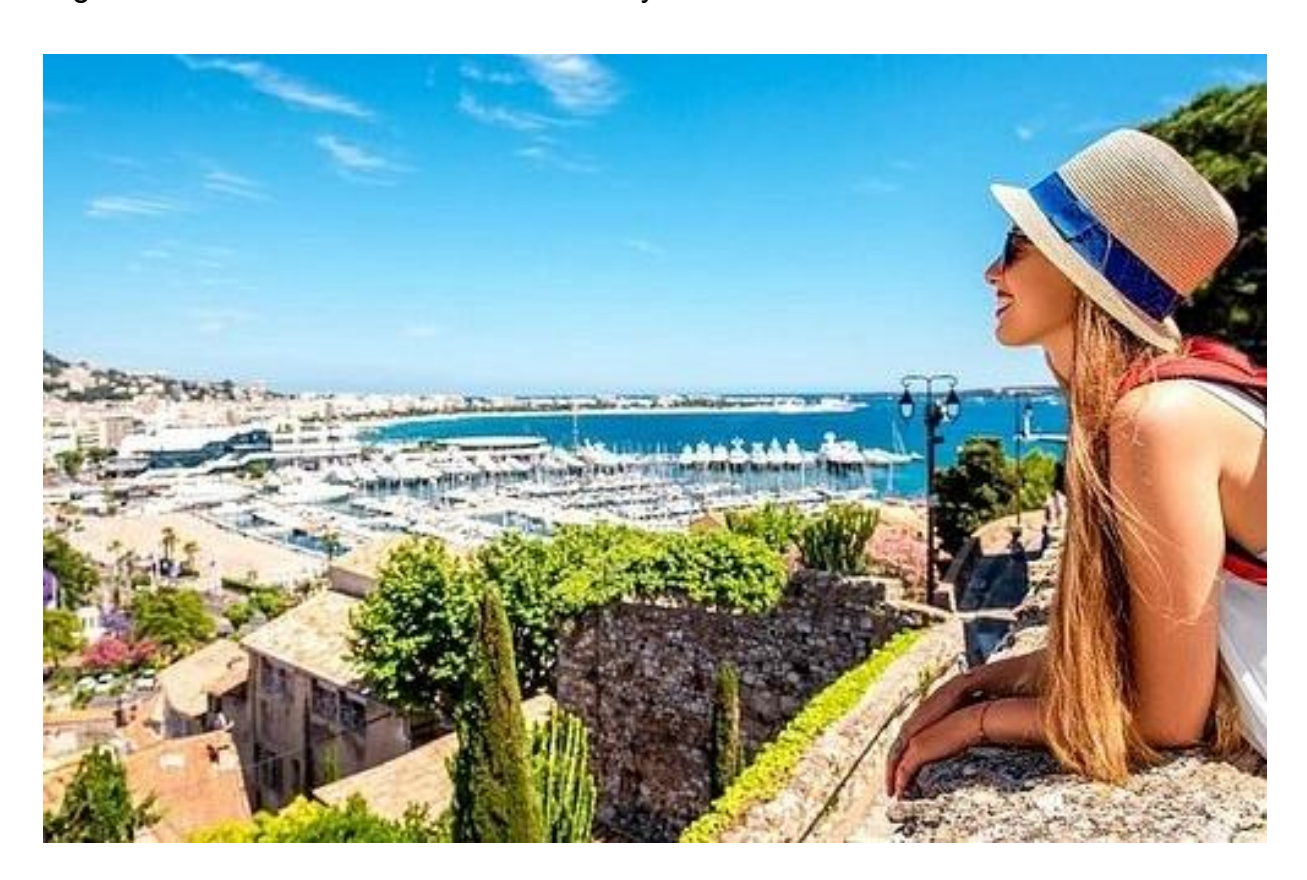
5:00 p.m. We meet in the lobby for a sunset drive along the Riviera for our 7:30 gastronomic experience at the 3 star Michelin Mirazur restaurant in the exquisite

10:00 a.m After your leisurely breakfast, there will be a professionally-guided walking tour of Monte Carlo that you're invited to join. In addition to the typical highlights, you'll be taken to see little-known architectural wonders, stroll landscaped parks, visit spectacular viewpoints, and see unique sculptures and street art. The tour lasts approximately 2 hours and guests should have a moderate physical fitness level. We might even sneak in a visit to a local bakery.