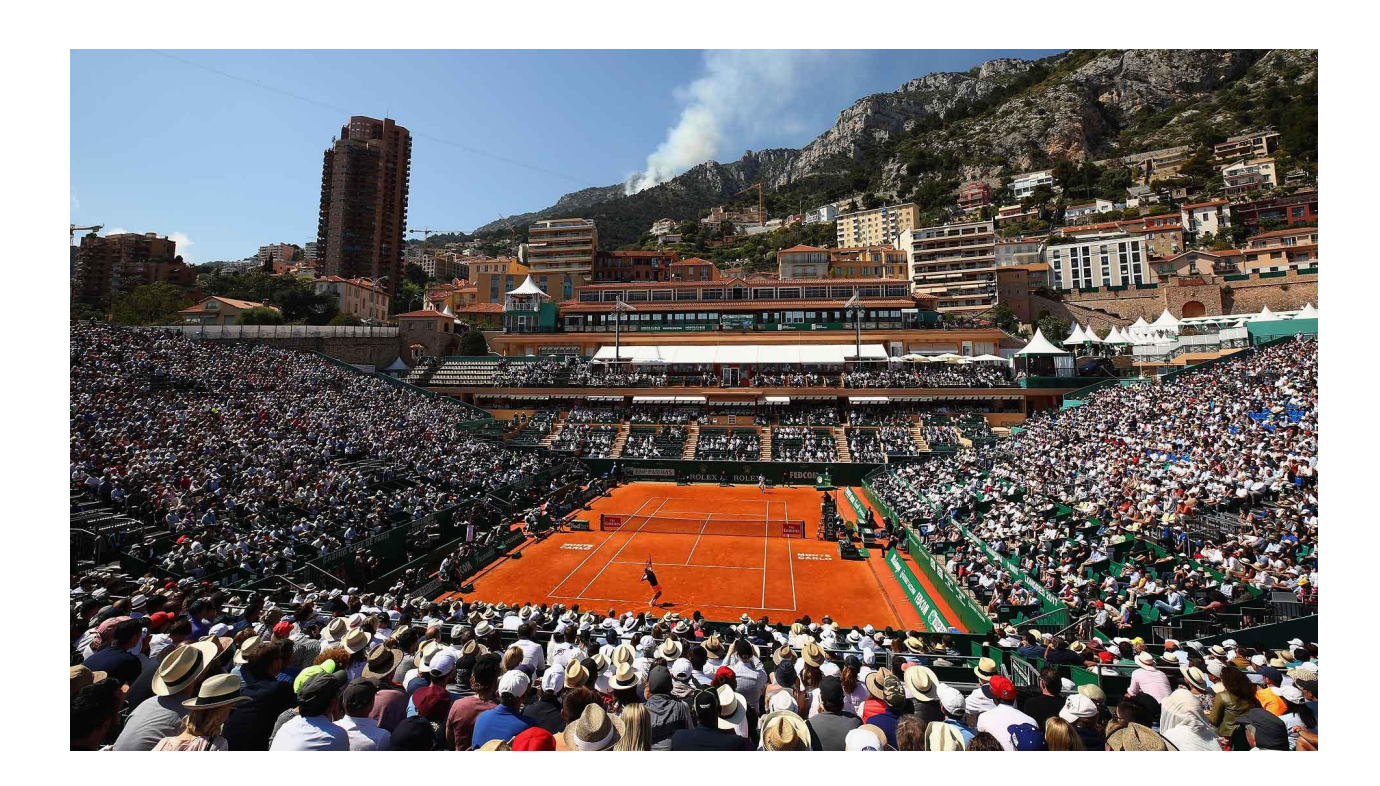
10:30 a.m. Each morning after your breakfast at the hotel, we'll meet in the lobby and make our way to the Monte Carlo Country Club, site of the Monte Carlo Rolex Masters. Guests can choose to take a quick shuttle ride transfer from the hotel or enjoy the approximate one mile stroll.

Center Court matches at the Monte Carlo Open begin at 11:30 a.m. with play generally ending around 4-5 p.m on Center Court. Matches on the outside courts, which you also have access to on a first come first served basis, will continue into the early evening. For your return back to the hotel you can either take a shuttle or walk.